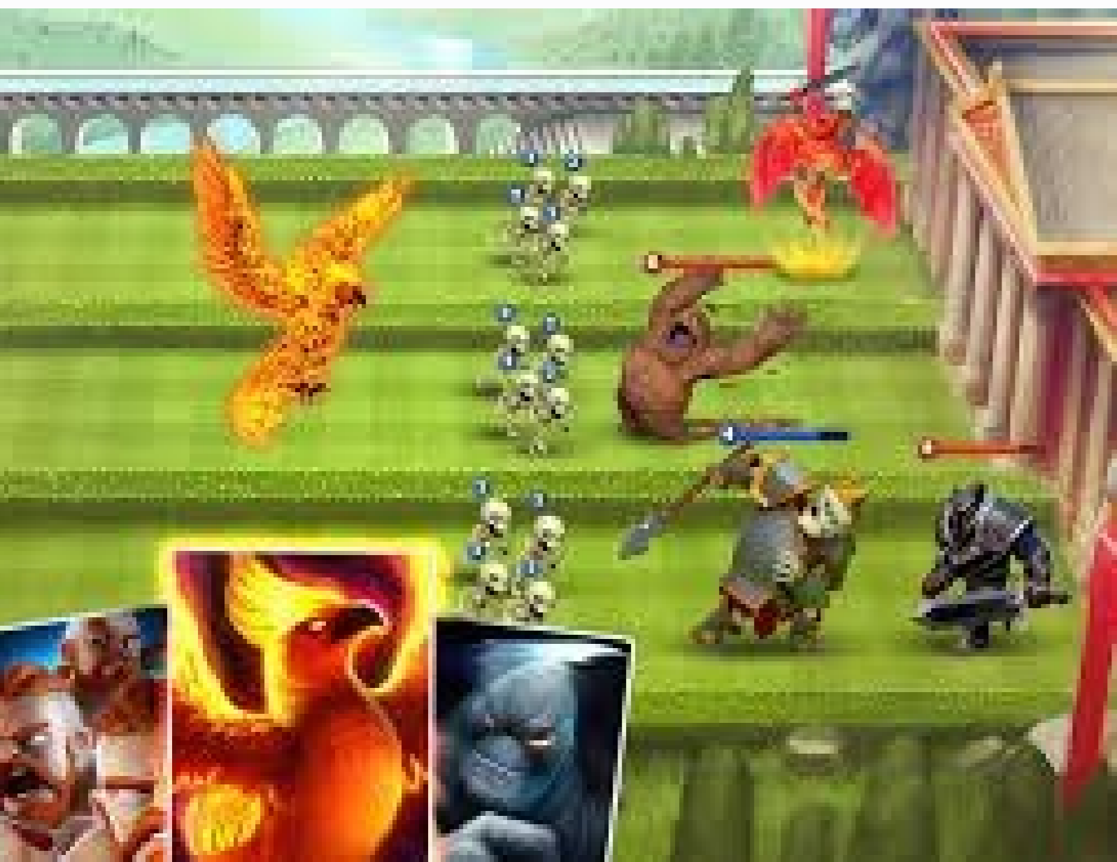
Castle crush tips. Castle crush mod apk unlimited gems 2020. Castle crush apk mod dinheiro infinito 2020. Castle crush release date. Castle crush mod apk unlimited gems 2020 download free. Castle crush mod apk unlimited gems 2020 download. Castle crush mod apk (unlimited gems 2020 download apkpure). Castle crush tier list.