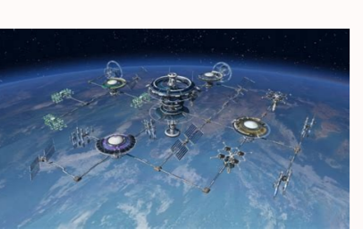
Anno 2205 space station layout. Anno 2205 space station.