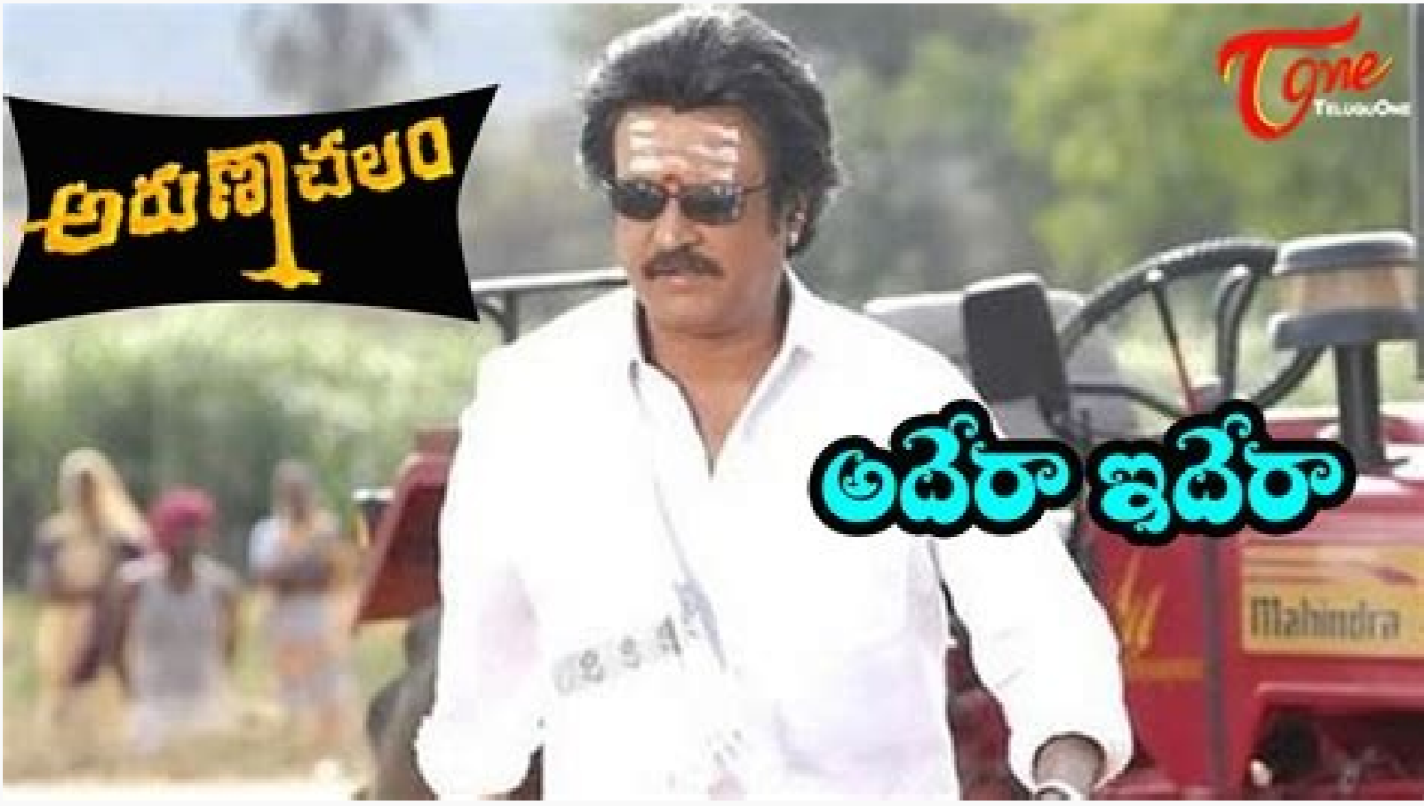
Arunachalam songs download 5starmusiq.