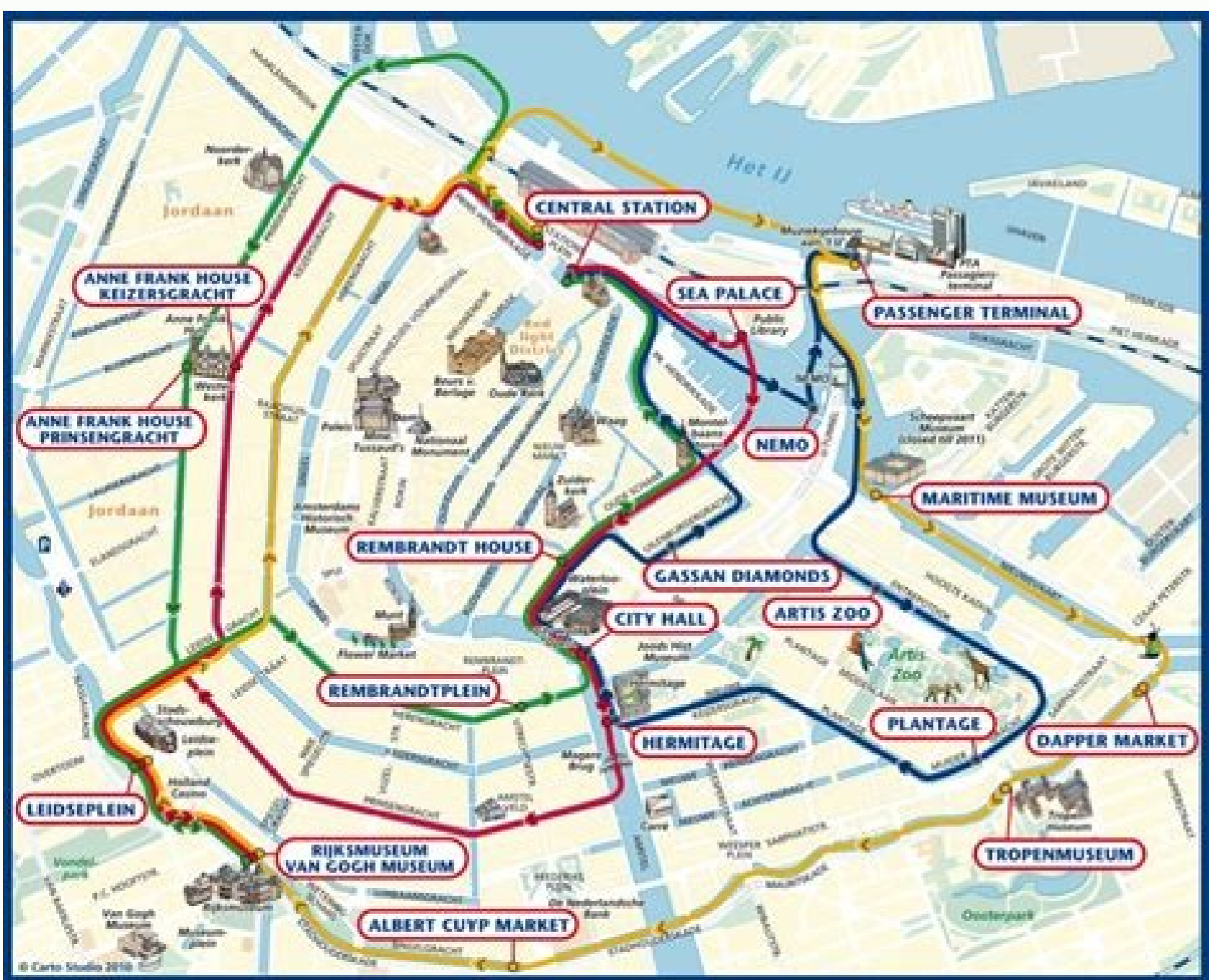
Mappa turistica amsterdam pdf.