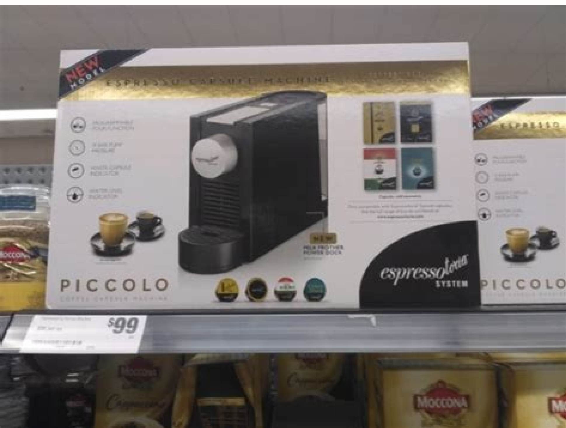
Capino coffee machine user manual.