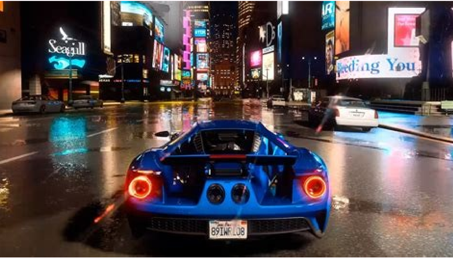
Gta 5 grand theft auto 5 for android apk & data download 2017. Gta 5 apk (grand theft auto 5) for android free download - google. Gta 5 grand theft auto download for android. Gta 5 apk (grand theft auto 5) for android free download - linkis.com. Gta grand theft auto vice city download for android. Download gta 5 apk + data (grand theft auto v) for android. Gta 5 apk obb (grand theft auto v) download for android. Gta grand theft auto vice city apk download for android.