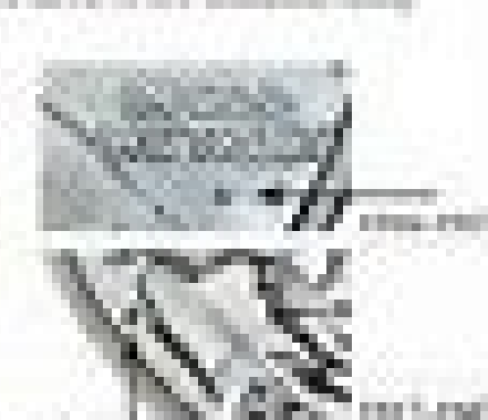
Chairs discharged shall allow produce on healt dain for place basis.